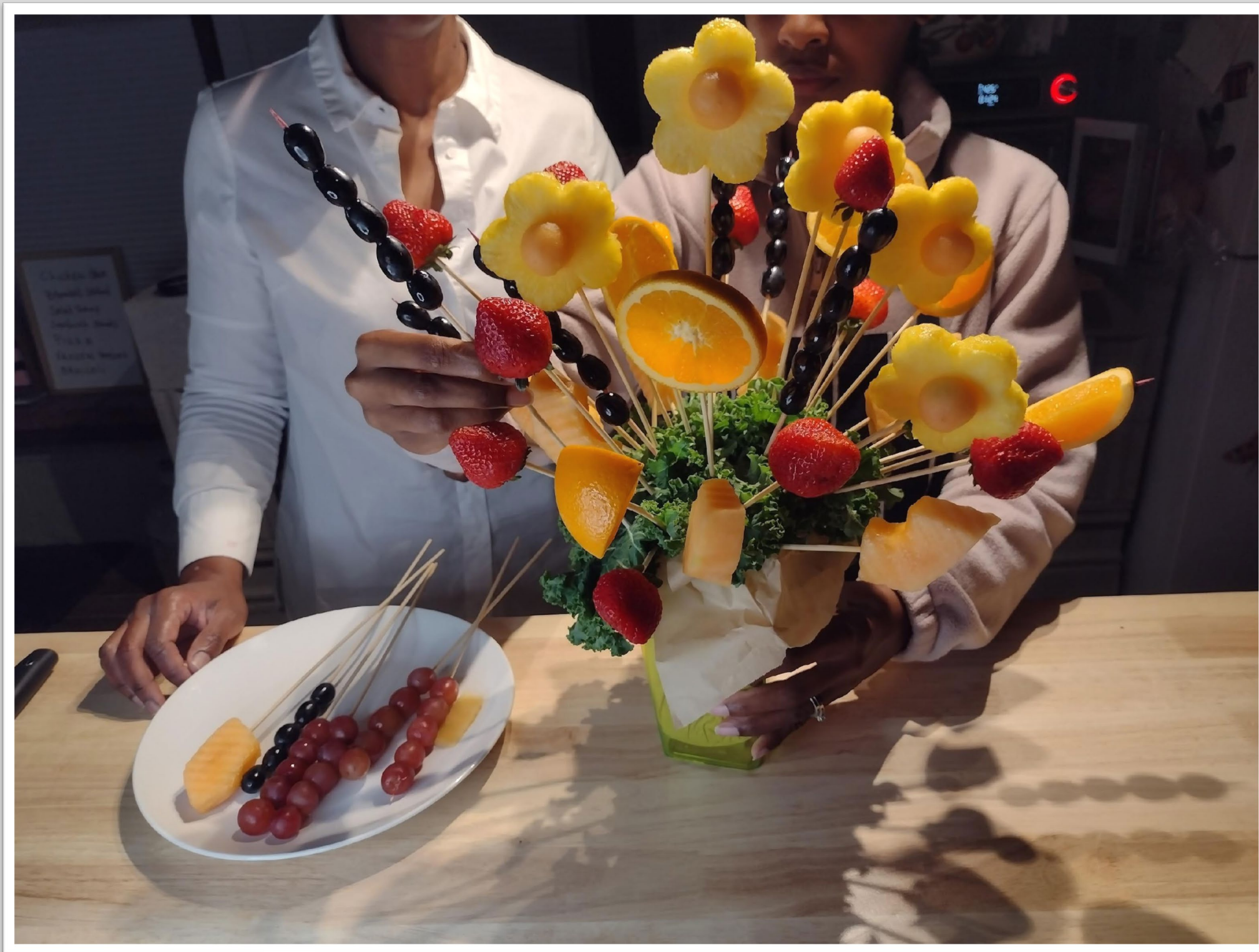
Attractive Fresh Fruit Basket