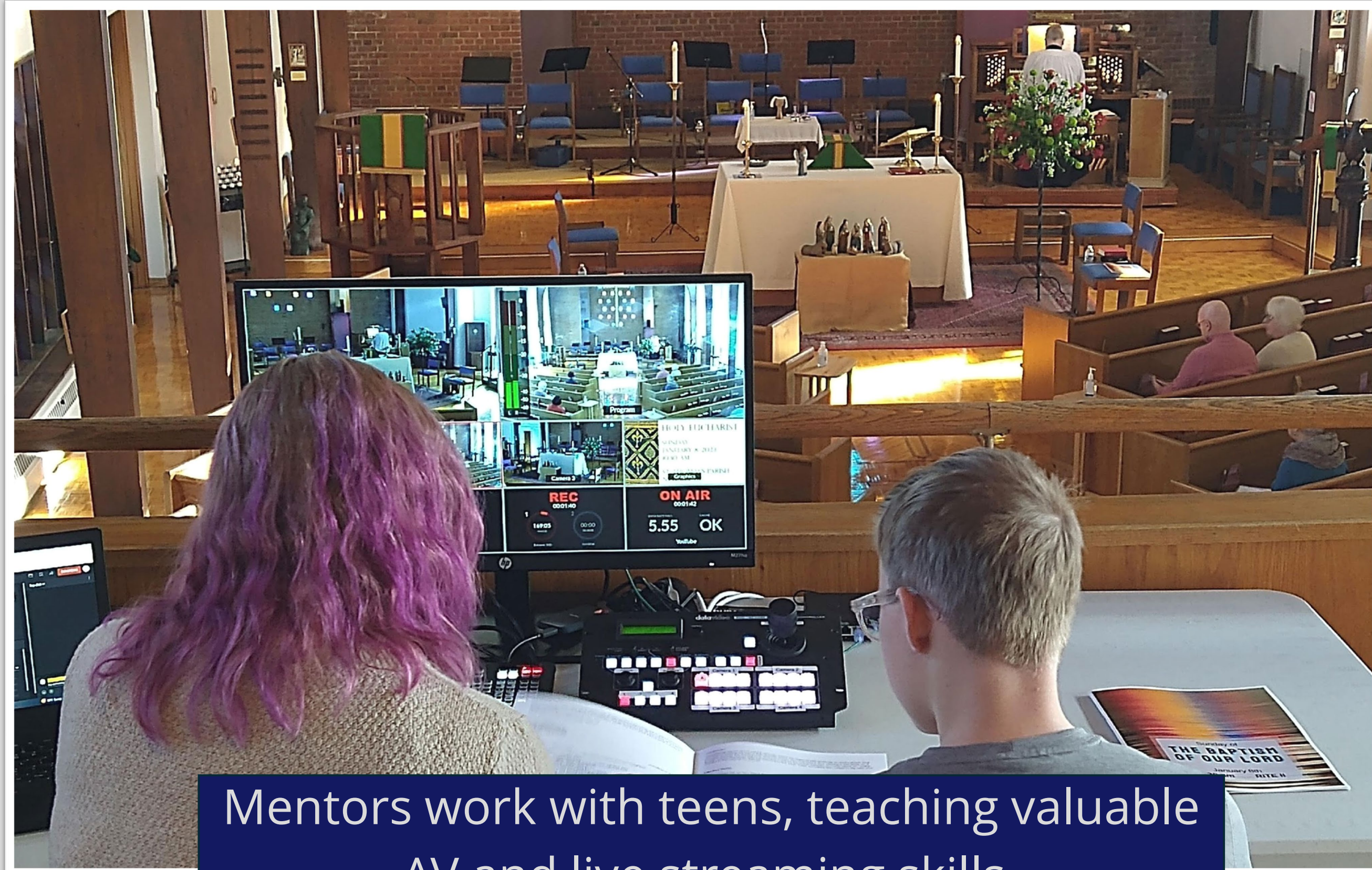
Mentors work with teens, teaching valuable AV and live streaming skills.