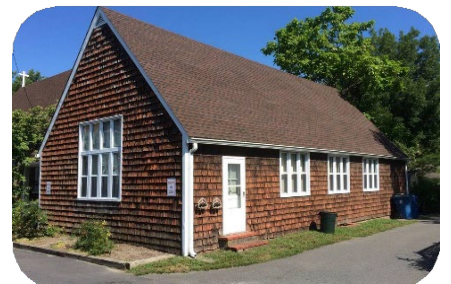
Above: St. John the Baptist, new roof