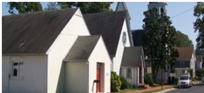
St. Peter's Church, Smyrna