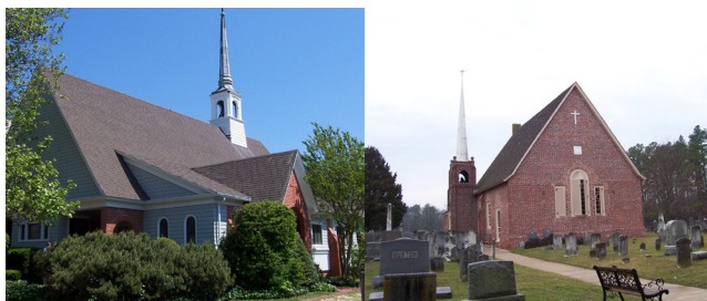
All Saints' & St. George's Chapel

Such is the diversity and long history of parish life in the Episcopal Church in Delaware. Each of these unique parishes will be featured in a brief video at the convention so, you will have the opportunity to get to know them a little better.