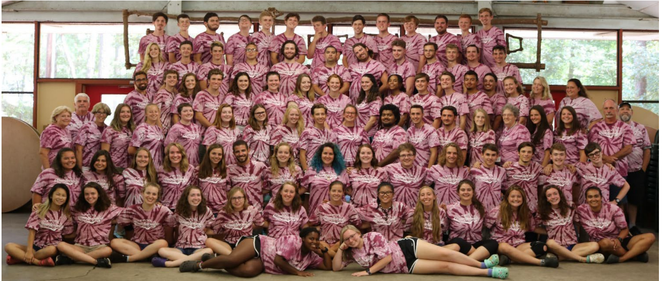
Our 2018 Summer Staff

The continued success of camp is truly a communion of so many guided by the grace of God. Thanks again to all who work so hard to make it happen!